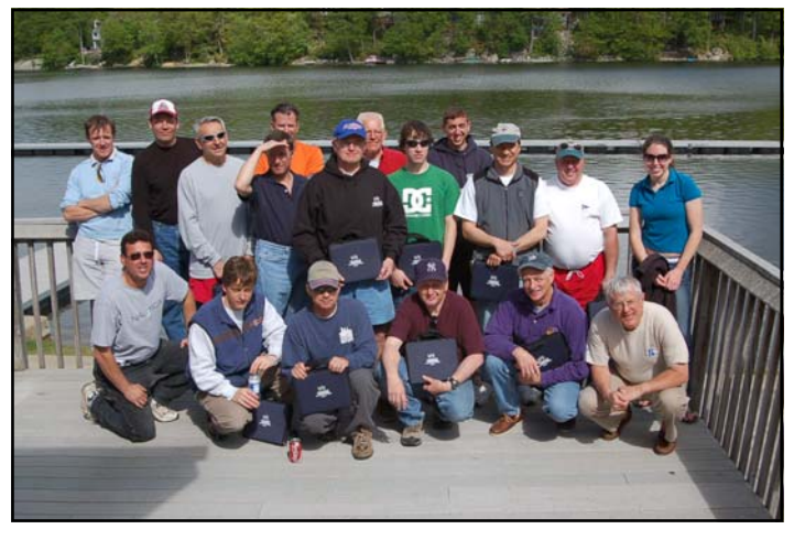
SANJL Competitors at HSC